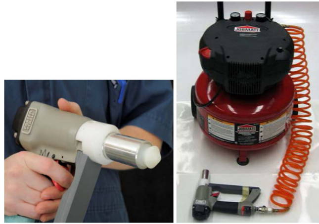
Figure 1. Photo of the Zephyr-Euthanasia equipment in the fired position with bolt head protruding (left) and the unfired position attached to a standard air compressor (right). See online version for figure in color.

Data were collected on 1 university research farm and 3 farrowing units from a commercial farm in Iowa. Ten stock people who were routinely responsible for performing euthanasia at the farms were trained to use the Zephyr-E. Stock People 1 and 2 were from the research